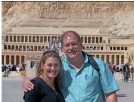
Surrounded by beauty at Hatshepsut's Palace

We spent ten days in Egypt, starting with a couple days in Cairo, followed by a flight to extreme southern Egypt, then a cruise down the Nile on board a ship that docked each day, allowing us to visit many, many ancient Egyptian temples. We walked through temples at Abu Simbel, Edfu, Kom-Ombo, and Luxor.