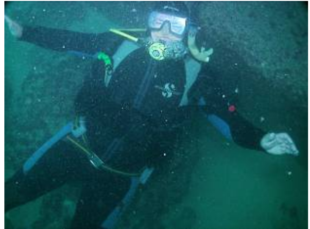
Floating over Pharos Lighthouse building blocks

The Quick Tour slideshow will take about four minutes, the other three slideshows take about twenty minutes each.