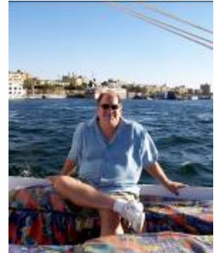
Chillin' on the Nile