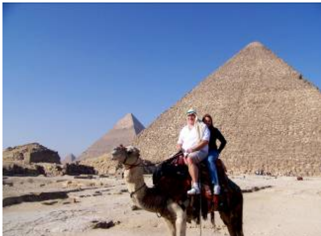
A mile from Cairo, no chiropractors in sight

Being as my 50 th birthday was coming up in a few months, I can't say I was terribly surprised.